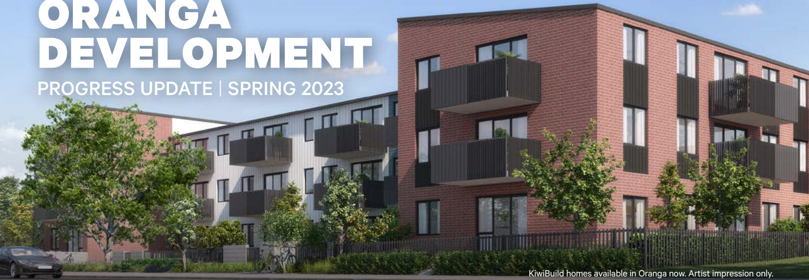
KiwiBuild homes available in Oranga now. Artist impression only.